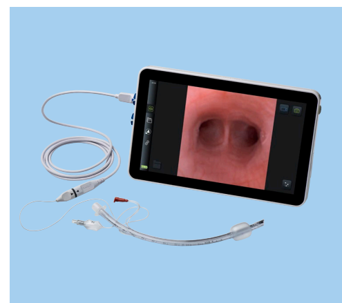
Ambu® VivaSight™ 2 SLT connected to Ambu® aView™ 2 Advance Monitor