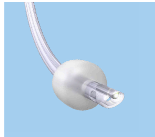
Ambu® VivaSight™ 2 SLT

* Monitors item number is different in each country. Please contact your local sales rep for the right number in your location.